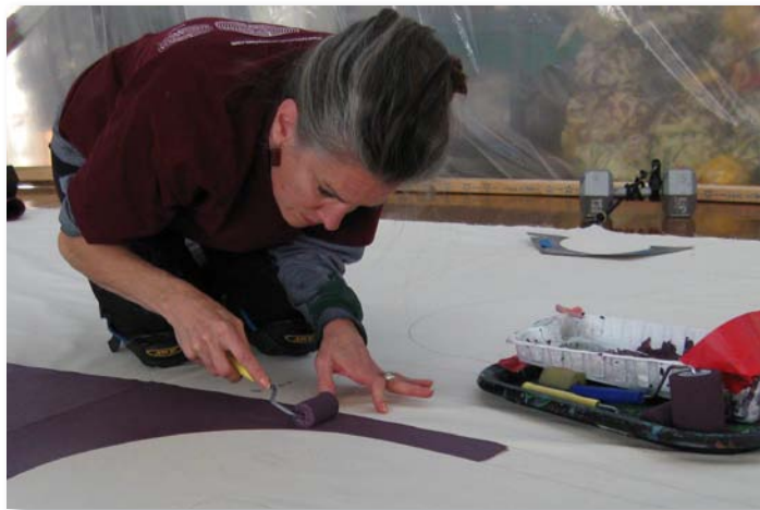
The labyrinth for St. Paul's Chapel under construction in St. Louis. Be watching for the labyrinth in the Chapel this summer!

Regulars at St. Paul's Chapel are used to seeing people walk in a circle around the interior perimeter of the chapel, known as the "swirl," as they look at the permanent 9/11 exhibit. Visitors, pilgrims, and worshippers now have an additional path to walk, with the chapel's new portable labyrinth, which arrived in April.