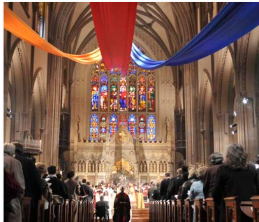
Ascension Day 2008 at Trinity.