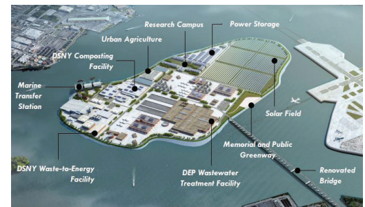
Rendering of Green Infrastructure Option