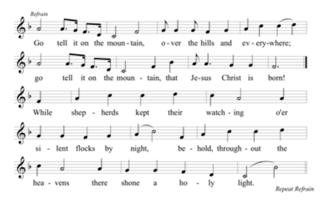
The first verse of "Go, Tell It on the Mountain" is sung by the choir and congregation as the children bring forward the angel and shepherds.